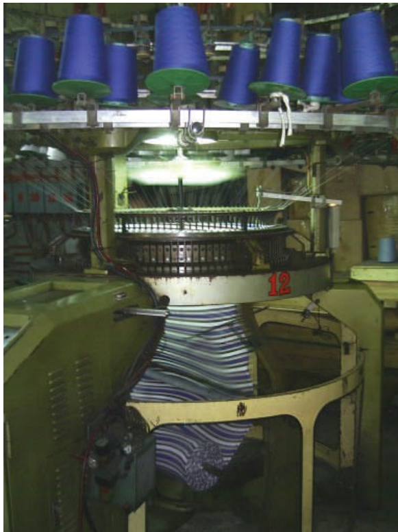
One of the Knitting Machines Being Fed by the Compressor