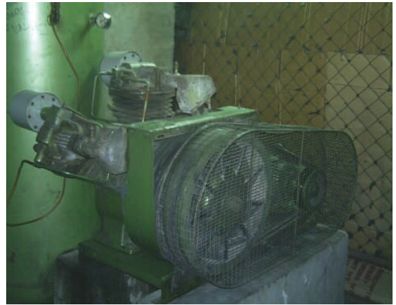
The Compressor Showing the Belt Drive and Reservoir

The unit was fitted initially with default settings however the soft start was an important factor in the choice to use EnviroStart because of the load changing and frequent starting of this item. Start control was required to both reduce the stress on the belts and also to limit the peak current excursions.