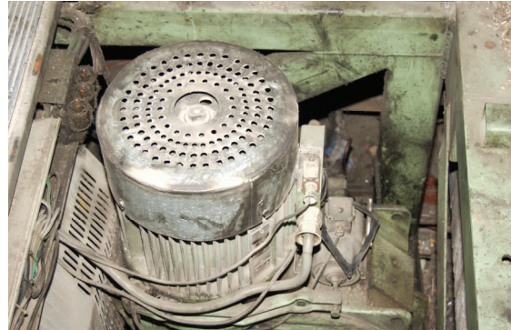
The Escalator Motor Within the Top Standing Pit

The system is running on average for 14 hours a day for 360 days a year. Like all escalators the loading on the system is actually quite small as the unit is heavily geared.