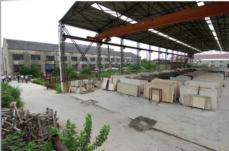
Ding Li Slab Storage Facility Adjacent to the Cutting Room